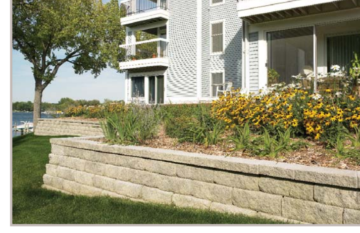
A natural-looking wall doesn't have to appear random. Instead of mixing block sizes, limit your project to just one size. This creates a more symmetrical effect.

The Anchor Highland Stone® retaining wall system combines earthen tones, rich textures, varied contours and all the advantages of the structurally sound rear-lip locating system, making it a reliable and easy-to-install alternative to natural stone walls. The new three-inchhigh Highland Stone units provide you with even more design options. Use these units alone or mixed with the six-inch-high blocks to create stunning retaining walls.