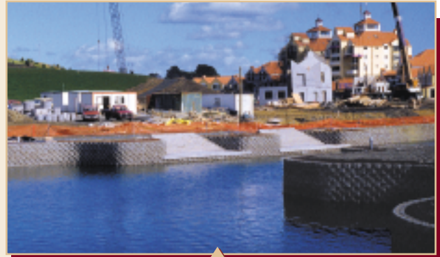
Gulf Harbour site during construction.