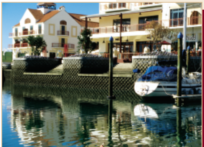
Gulf Harbour Marine Village project with Keystone canal walls.