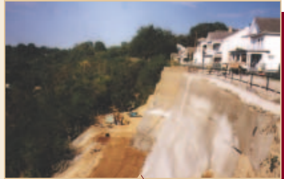
The top of the Keystone wall provides new front yards for bluff homeowners.