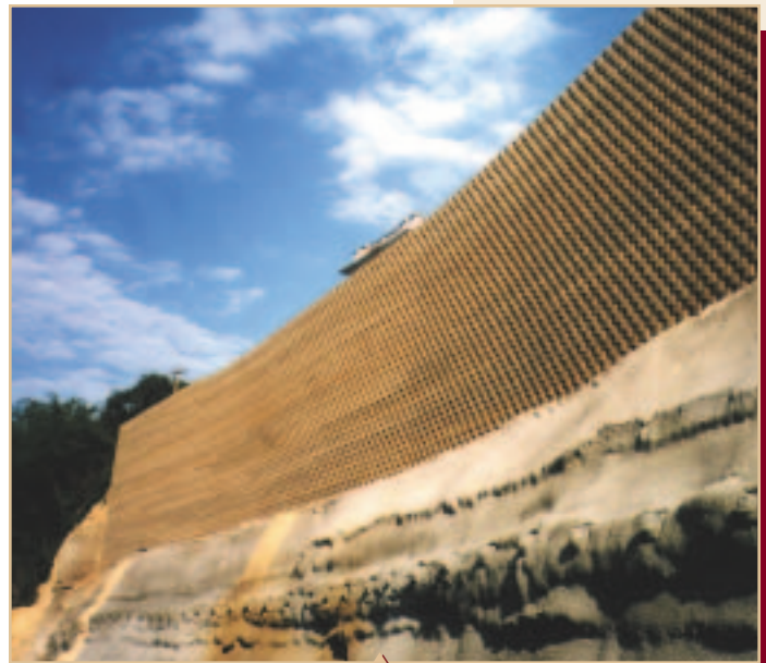
32’ High Keystone Wall solves the historic “Natchez Bluff” problem!