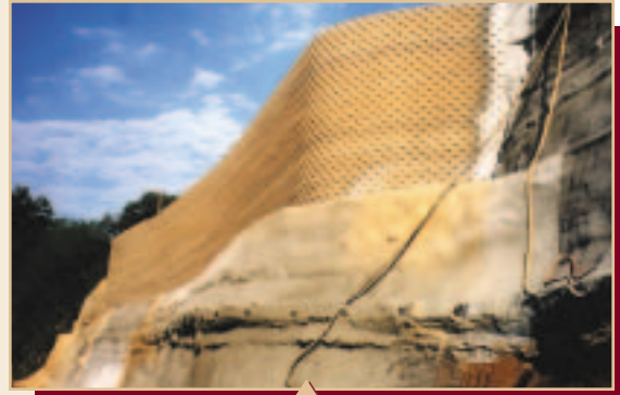
View of wall with soil nailed “bench” below.

Conventional fill, such as sand, would have cost about $5 per cubic yard placed, while the cost of the lightweight aggregate solution was approximately $30 per cubic yard placed. This lightweight material was needed to solve the problem due to the inability of the underlying wall to carry the load of the conventional fill. Combining these various stabilization systems was an economical and yet ideal solution.