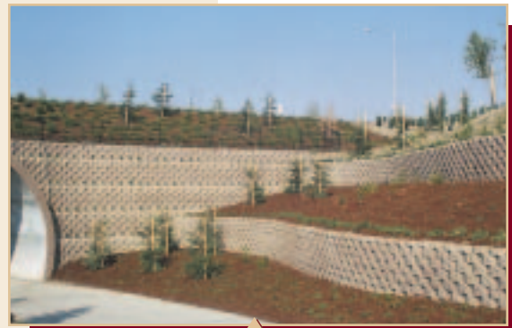
Planter unit and terraces add landscape amenity to structural walls.