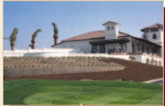
Combination of reinforced slopes and Keystone walls at clubhouse.

Basalite Corporation , Keystone's manufacturer/representative in North Highlands, CA, supplied approximately 30,000 square feet of units to create the walls for Phase I. There will be over 100,000 square feet of Keystone used on the site when it is complete. Phase I also included seven multiplate arches supplied by Contech Construction Products, Inc. Three of these arches help support Bollinger Canyon Road , the main thoroughfare for the community.