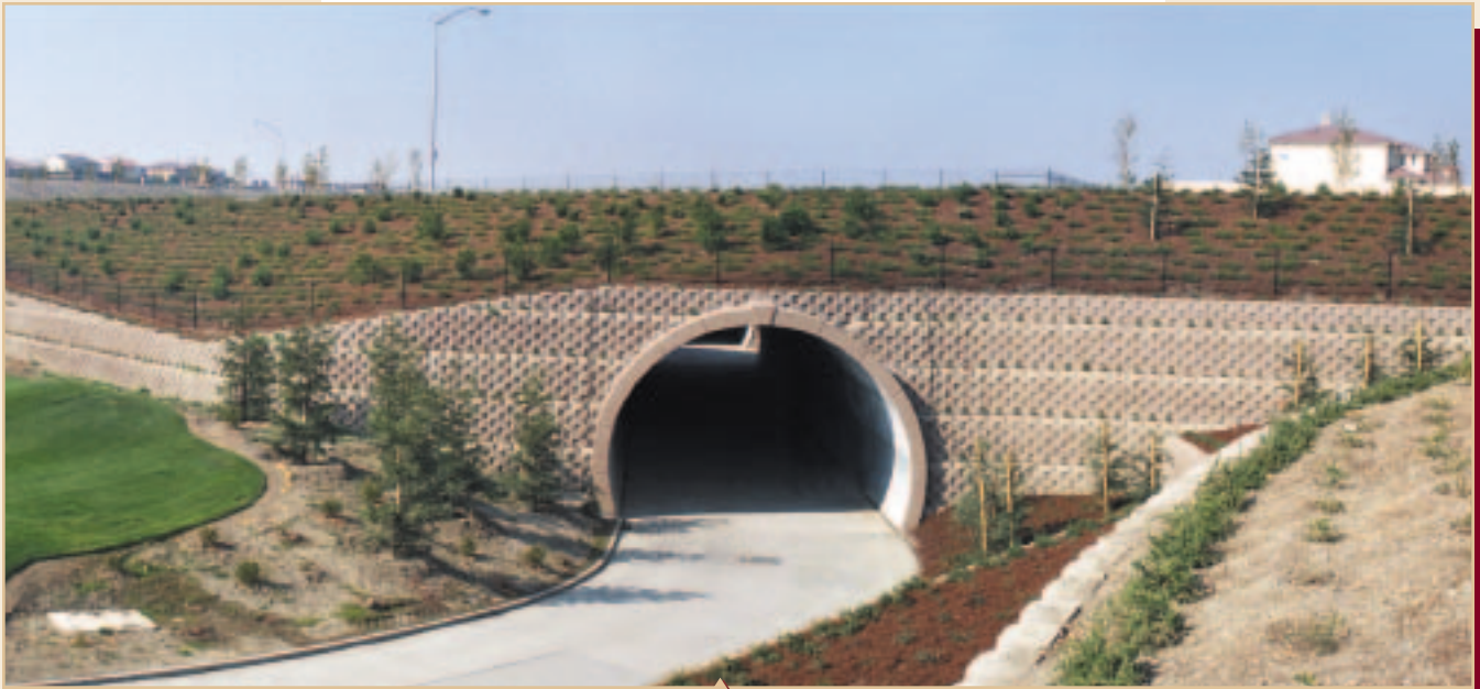
Keystone site solutions include headwalls at tunnels, roadway support, terraces and planter units for landscape amenities.

Keystone! The right form & function for site solutions at Gale Ranch.