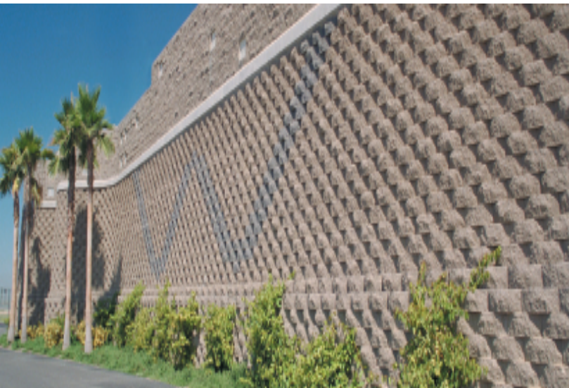
Keystone helps create a little school spirit.