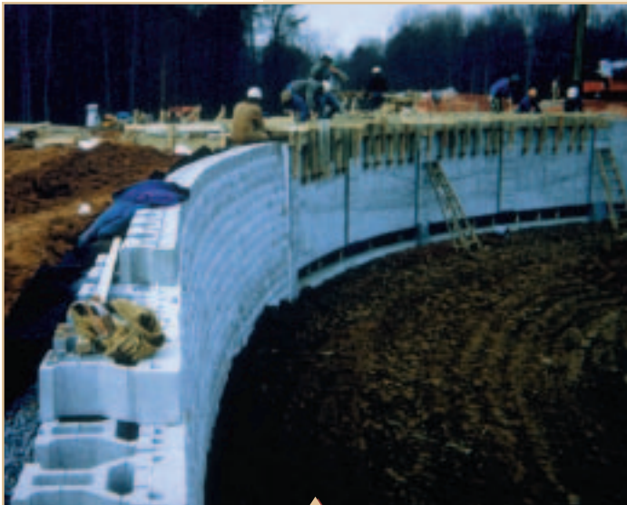
Keystone wall built next to cast-in-place concrete spillway