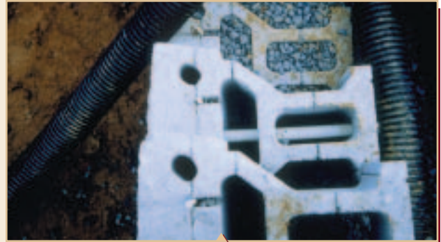
Drain tile system with PVC pipe weep holes through block

The result was a functional, attractive, low cost water management system built with Keystone retaining wall units. Keystone turned a storm pond into a pleasing water feature, adding value and curb appeal to a new housing development.