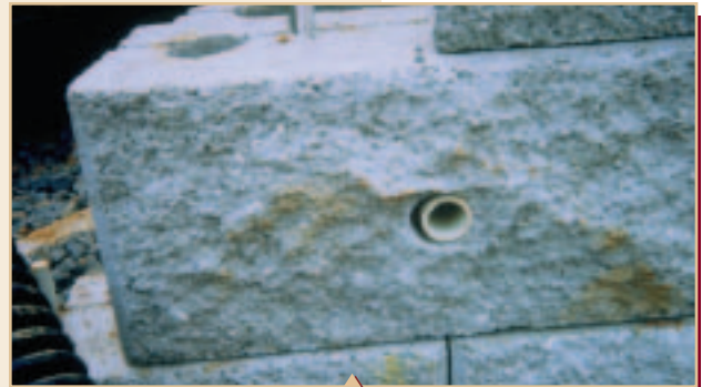
PVC pipe used as weep hole