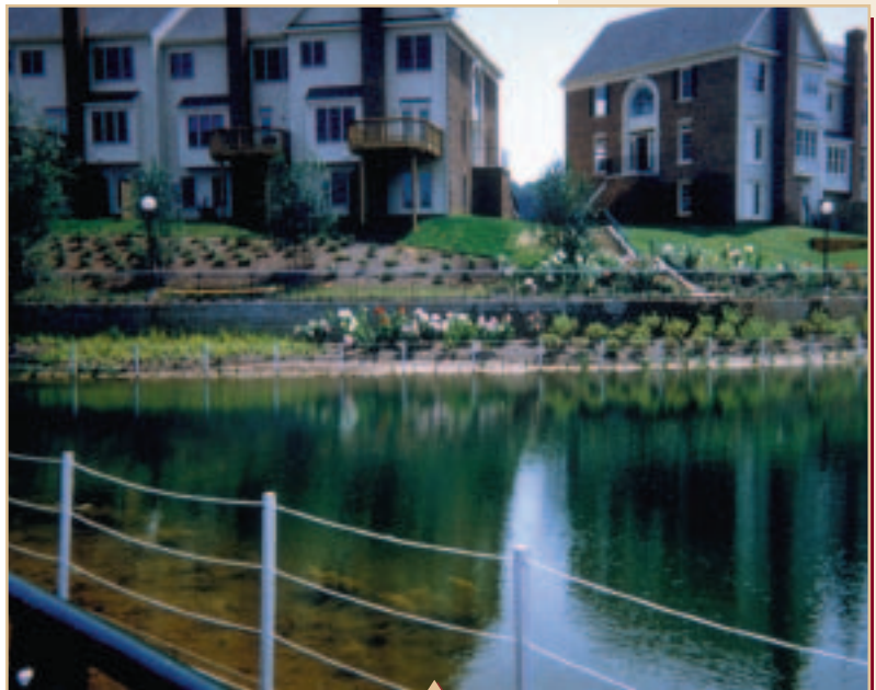
Finished retention pond surrounded by Keystone Retaining Walls