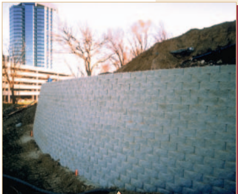
A high profile, residential development received approval from the City of Bloomington, Minnesota to use KEYSTONE in and around protected wetlands within the city limits.