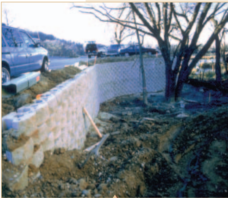
Keystone flexibility allows conformity to site constraints and soft subbase soils.

This project started out with the intent of using 18,000 to 20,000 square feet of KEYSTONE, but with the City of Bloomington re-evaluating sidewalk locations etc. and the owner making a few design changes, the total project used approximately 25,000 square feet of KEYSTONE.