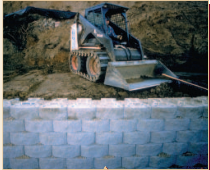
Construction is easily accomplished in tight confines.

The Keystone Retaining Walls at the pond location have 2 feet (0.6m) of 3/4" (75mm) crushed stone that is wrapped in filter fabric in the drainage zone. This was needed to handle the effects of two underground springs under the base of the pond walls. Also in these areas, several layers of geogrid were placed in the crushed rock zone to stabilize the foundation.