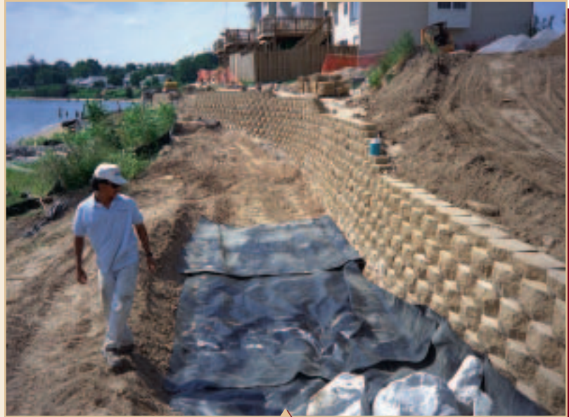
Installing the rip-rap at the base of wall.

a sediment pond at several sections of the wall. The project had to be stopped and re-engineered to account for the high moisture content of the soil in the vicinity of the sediment pond, which added additional geogrid. The 8,400 square foot wall is 900 feet (274m) long with maximum wall heights of nine feet (2.7m). Keystone Standard Units with the 3-plane rock-face texture were used on the project. They were placed on 3 feet (0.9m) of compacted 3/4" (20mm) gravel to overcome a soft base sub-soil condition. The project used approximately 3,000 square yards of Mirafi 5T & 7T with embedment lengths between 9 and 10.5 feet (0.9 - 3.2m). The wall design also called for