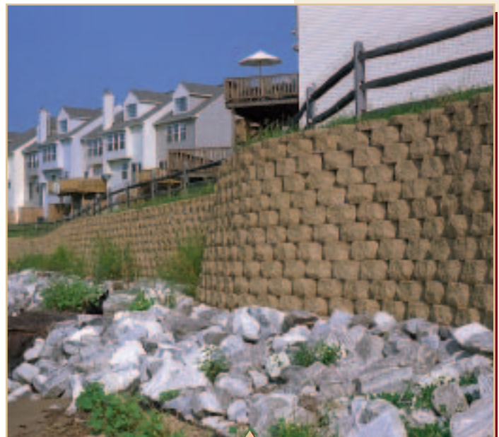
Keystone Walls offer an aesthetically pleasing solution at Stoney Beach while providing stability to the shoreline.