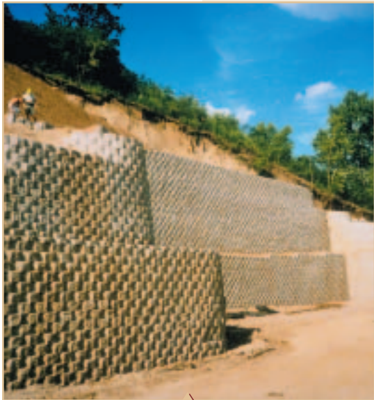
30 foot high terraced Keystone wall with a sloped top elevation.