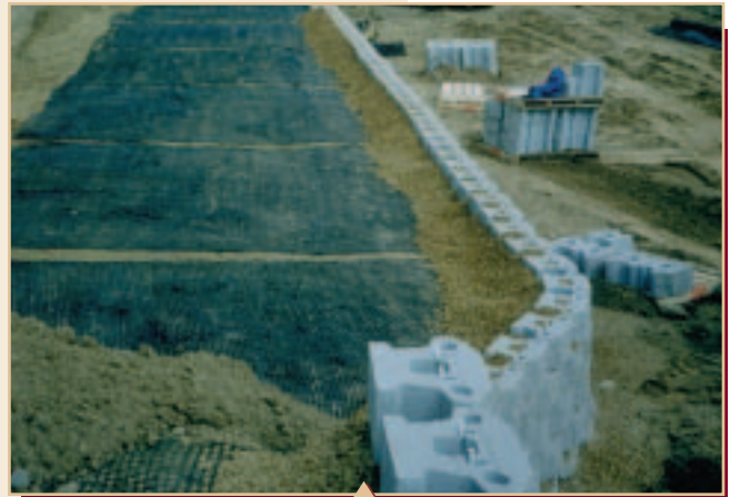
Keystone Compac units installed with geogrid.