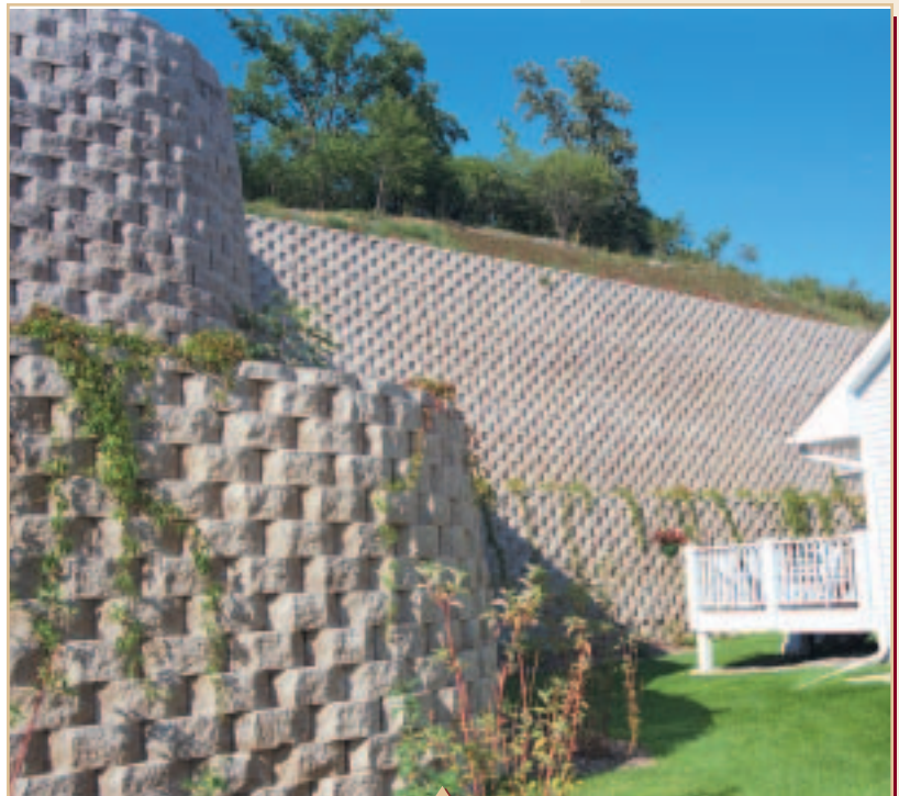
30' (9m) high Keystone Wall in Edina, Minnesota creates space for housing development