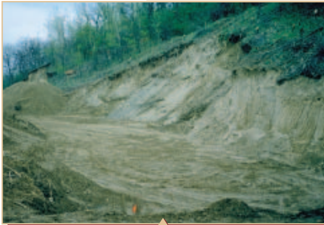
Cut site before construction.

The result was an attractive, structural, economical Keystone retaining wall, allowing the developer to use an ideal location as a new development site. Keystone turned a problem into a great looking solution!