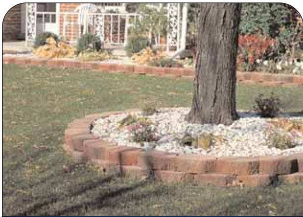
Garden Borders or Tree Rings