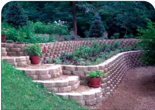
Straight or Curved Walls