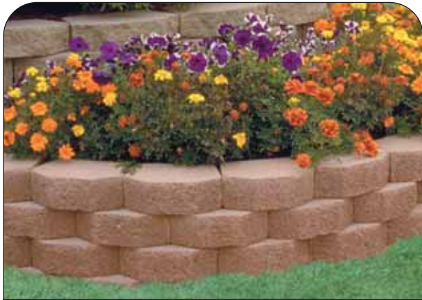
Flower Beds or Planters