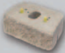
“Old World Charm”

Random and rugged, yet blended with color and character, these high strength concrete modules appear as natural stone, but have the latest built-in technology of the Keystone pin assured connection.